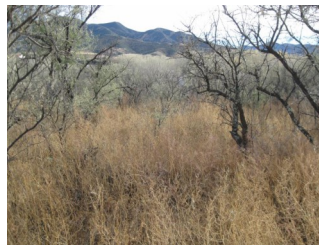
View from potential site of CHOP property acquisition

For the latest updates and details please attend the upcoming Annual Membership Meeting or contact us directly. We are still fundraising for additional property acquisition contributions. Thank you for the support.