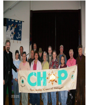
CHOP Members display the organization's new banner at the 2010 Annual Membership Meeting

CHOP connected with three new local families who are interested in the Homeownership Program