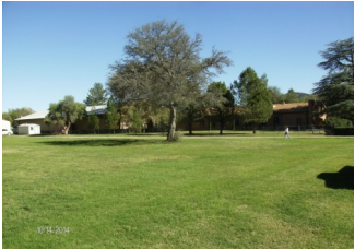
CHOP thanks Patagonia Town staff for maintenance support at Gopher Field