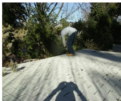
Local Contractor, Daniel Mendoza, assessing roof condition for possible CHOP Home Repair project in 2020.