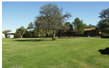
CHOP's property, Gopher Field, is the focus for a permanently affordable home project, including four single-family residences plus open space.